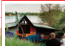
Freetown Christiania A partially self-governing neighbourhood.

You can purchase Metro tickets from the Metro ticket machines located in all Metro stations. Here you'll also find special tickets for dogs and bicycles. If you have a valid Copenhagen Card, you can ride the Metro as much as you like at no extra charge.