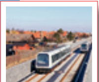
New stations On September 28 this year five new Metro stations open on east Amager.