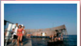
The beach Play, jump, swim in Øresund. Great view to Sweden.