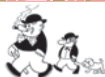
The Storm P. Museum Beloved humourist, painter, actor and writer (closed on Mondays). Frederiksberg roundabout.