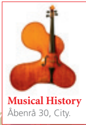
Musical History Åbenrå 30, City.