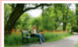
The garden of the Danish Horticultural Society Pile Allé 6.