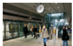
Metro The new Metro in Copenhagen is fully automatic and driverless.