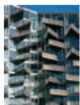
VM Huset Modern architecture and contemporary living, Ørestad-style.