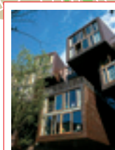
Tietgen Dormitory Modern architecture with organic forms in Ørestad.